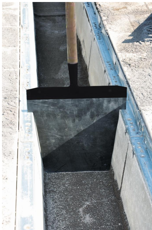
Fig.: Levelling device for peeling off the substrate (here with DRAINFIX CLEAN FSU)

The substrate must be filled into the channel with drainage pipe without being compacted and levelled with a strickle or levelling device.