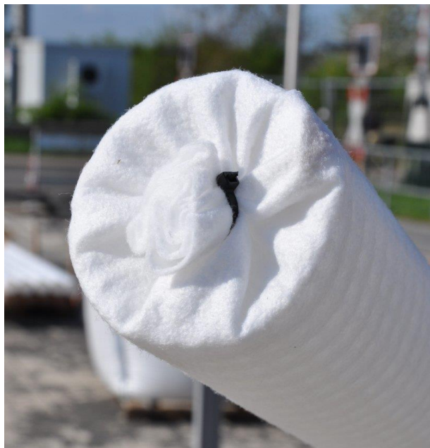
Fig.: Starting element, tied

Once the channel bodies have been installed, the drainage pipes are laid freely in the centre of the channel base, starting with the end element. To do this, insert the pipe bend or T-piece into the opening made in the channel wall. Care must be taken to ensure that the outlet is not obstructed by drainage pipes that are inserted too deeply. Next, install the drainage pipes and, if necessary, fittings for the centre elements and finally the starting element. If necessary, cut the drainage pipes to the required length.